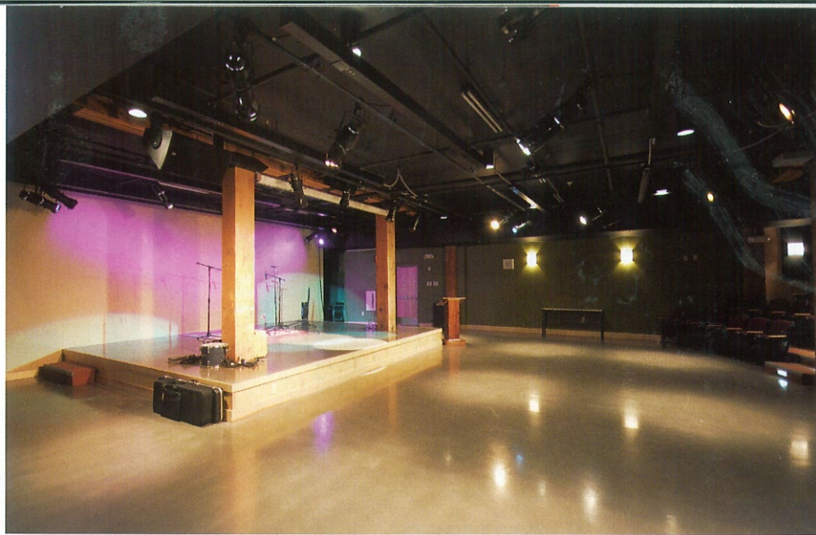
The black-box theater (left) has so far been transformed into a Shakespearean forest and a tenement sweatshop.